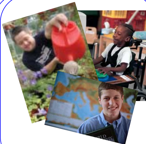
Aspire to great things!

In the summer of 2004, nine independent organizations came together in Rockdale County Georgia with a common belief that by working together in a collaborative relationship they could improve access to recreation, training, assistive technology and social activities for the special needs population and provide more opportunities. We chose the name ASPIRE because: We ultimately ASPIRE to include all Special Needs People in the life of Rockdale County through Recreation/Social activities and Experiences.